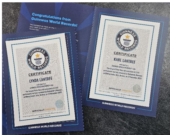
Well worth the effort!!