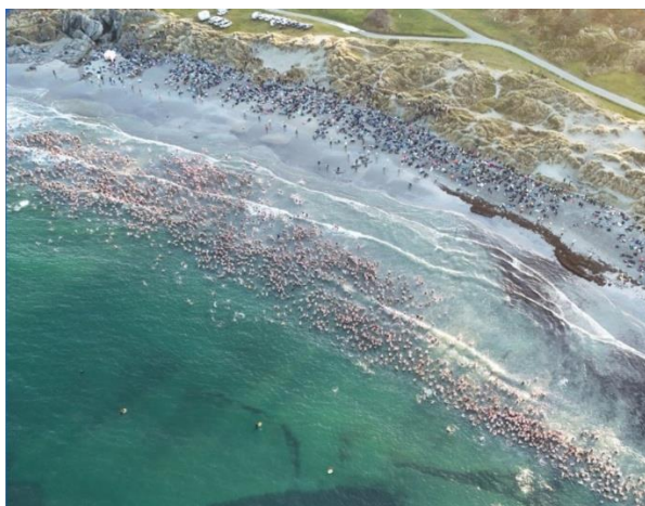
That's a lot of swimmers