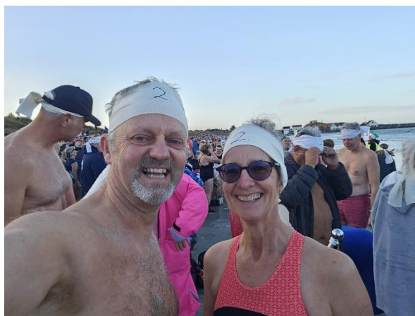
At least it's sunny in Norway