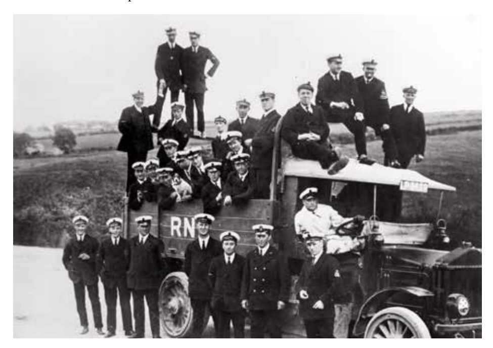
Naval personnel off on a trip to town.

Four Distinguished Service Crosses (DSC), three Distinguished Medals (DSM) and nine mentioned in dispatches were awarded to the sailors of RNAS Mullion.