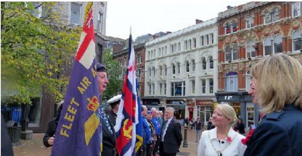
Poppy Day/Week Launch in Birmingham

in B'ham @ the First Memorial to Admiral Lord Nelson