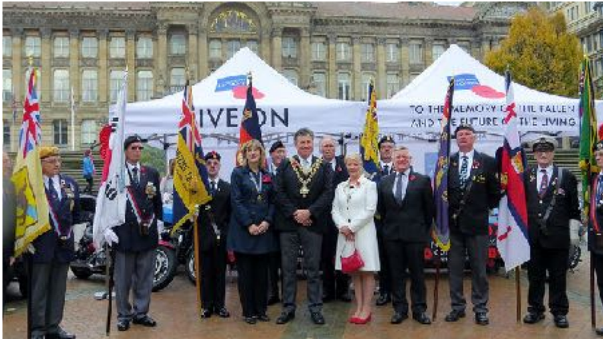
2016 Poppy Day / Week Launch Birmingham