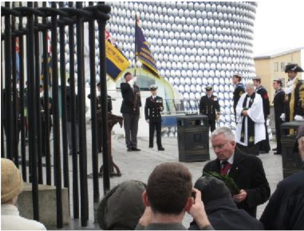
A Blustery Trafalgar Day Parade

in B'ham @ the First Memorial to Admiral Lord Nelson