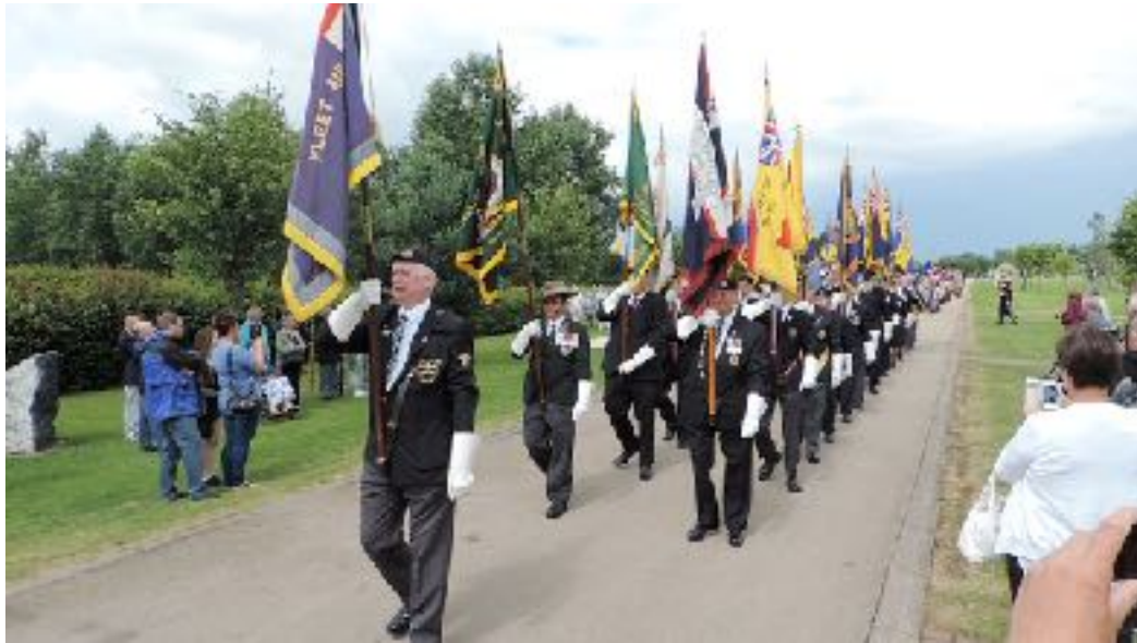
National Service Parade @ the National Memorial Arboretum