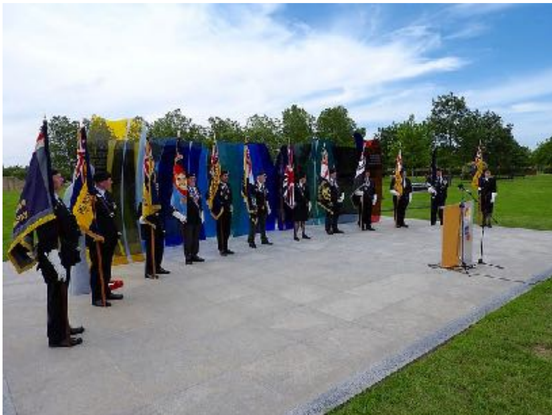
Memorial Service for the 100 anniversary of Battle of Jutland in 2016 At the National Memorial Arboretum RNA memorial