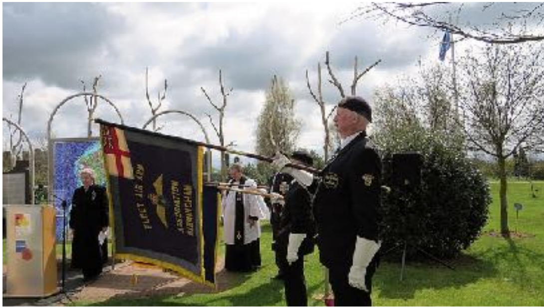
The 2016 memorial Service on ANZAC Day at the Gallipoli Memorial NMA.