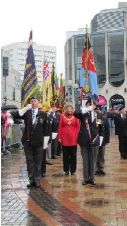
Wet Armed Service Day Parade in Birmingham Centenary Square